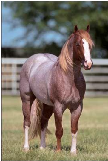
(Picture of a Strawberry Roan Horse) -this one has a blaze face and three white stocking legs-

Then I knows that the hosses I ain't able tuh ride Is some of them livin'—they haven't all died, But I bets all muh money they ain't no man alive, Kin stay with that bronk when he makes that high dive.